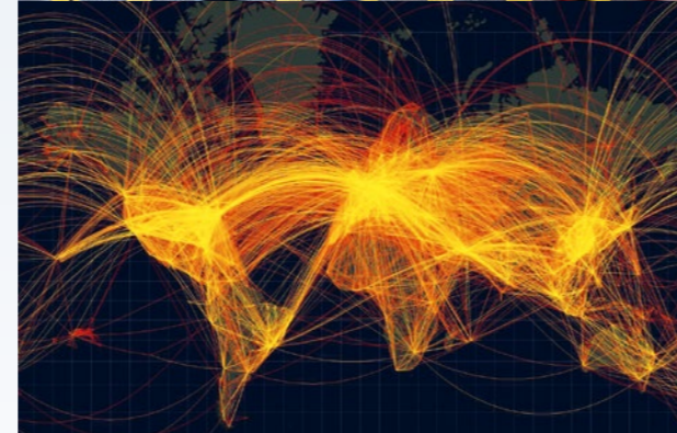
The global flight network

movements on buses and trains. Scientists can also link several data sources, for instance mobility data and information from social networks with pathogen genome data, in order to evaluate trends even better.