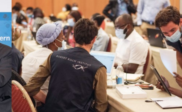
Training in Namibia

RKI has been a sought-after partner for public health actors worldwide and has supported crisis response in more than 70 countries – sometimes with strategic advice, sometimes with training for health workers, sometimes with the expansion of laboratories. The institute also has an international focus on non-communicable diseases – obesity and cancer pose major challenges to populations