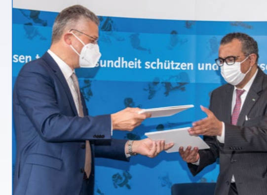
WHO Director General Tedros Ghebreyesus at RKI, 2021

Be it emerging respiratory pathogens like SARS-CoV-2, multi-resistant bacteria or highly-pathogenic viruses like Ebola: it has never been easier for pathogens to spread than in today's mobile, interconnected world. In order to identify and address health hazards in good time, an efficient public health care system is indispensable. The Robert Koch Institute cooperates with partners