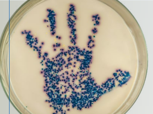
Traces of bacteria on a hand

Some of these infections could be prevented by consistently adhering to hygiene measures, for