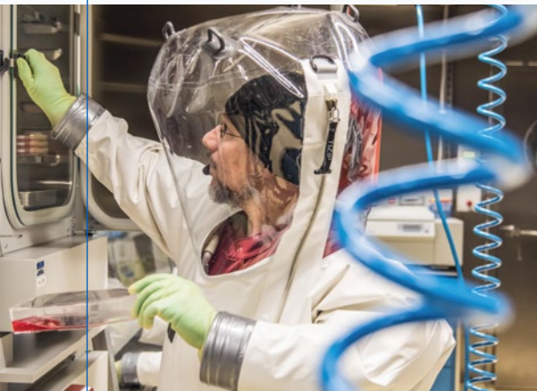
RKI's BSL-4 laboratory

"Dirty Dozen" – that is the name of the group of pathogens and toxins that, at least theoretically, could be used in terrorist attacks. Anthrax bacteria are among them, the pathogens of plague